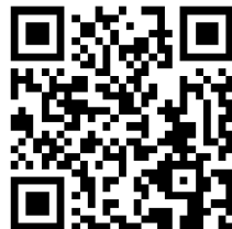
Stay in Touch

You can fill out a Digital Inquiry Form to stay in touch by scanning this QR code or ask the Host for a paper copy at the Welcoming Table.